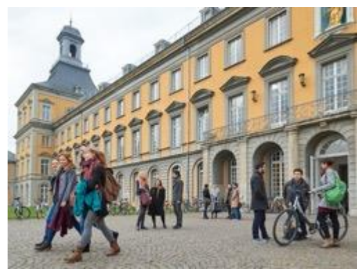
PhD degree, Applied Physics at University of Bonn (Germany)