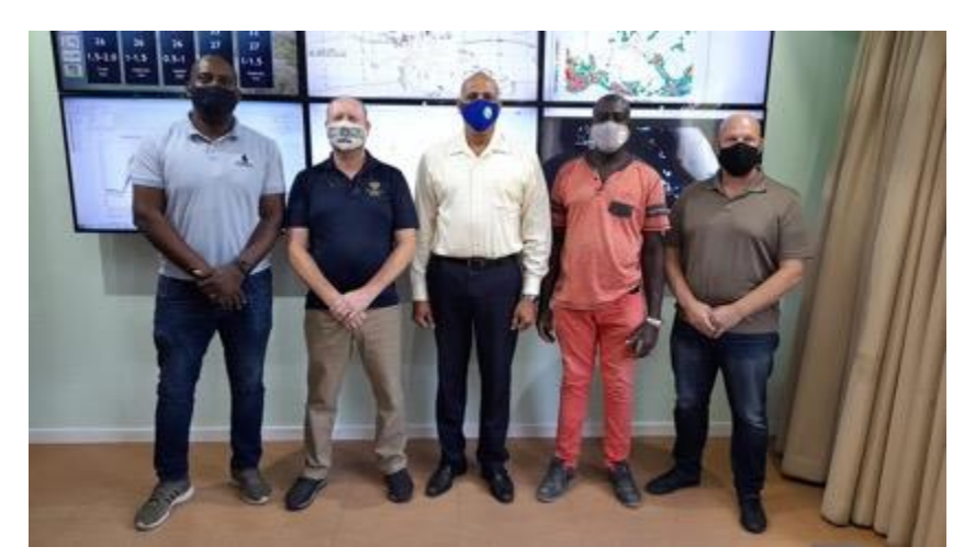
Technical department training