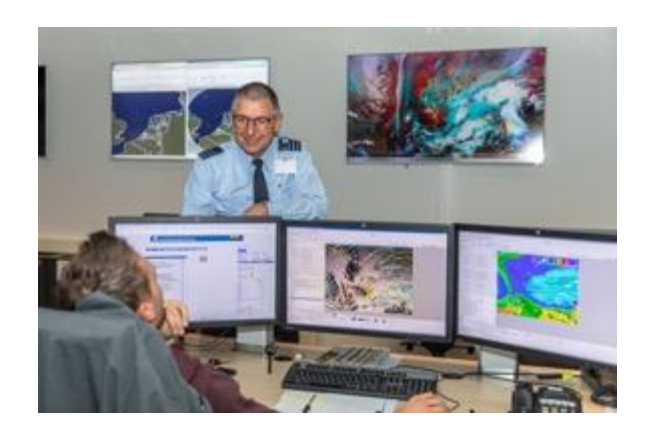
WMO Class II+ at Royal Dutch Air Force (the Netherlands)