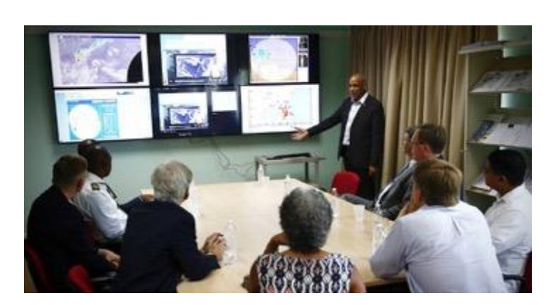
Briefing to the King