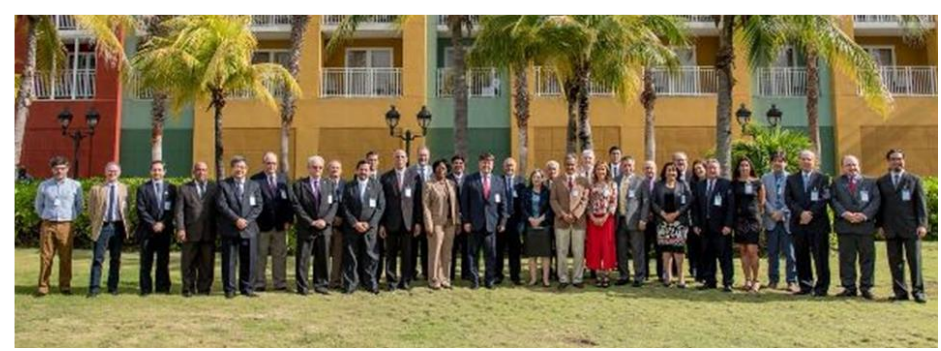
Iberoamerica meeting in Curaçao