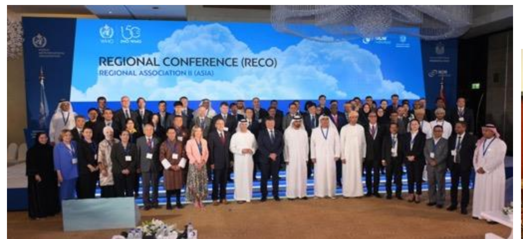
) Initial and the Ethiop